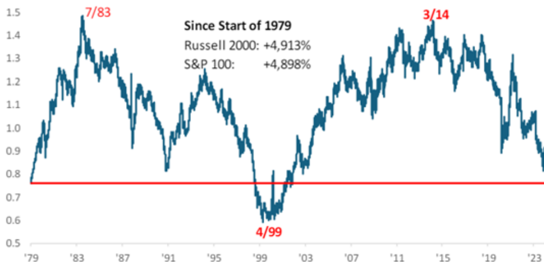
Exhibit 2. Ratio of Russell 2000® vs. S&P 100: 1979 - 2024

Finally, we are asking ourselves, might history repeat or at least rhyme. The chart below compares the performance of the Russell 2000® smaller companies index to the S&P 100 large-cap index.