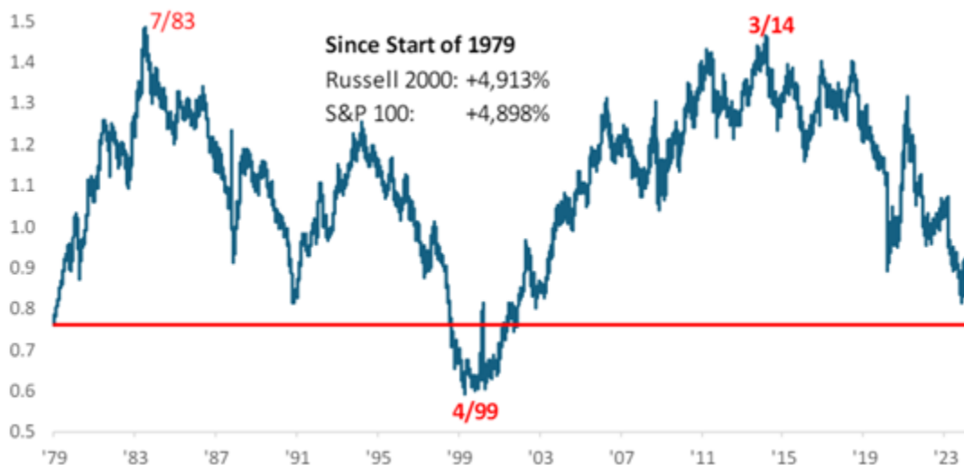
Exhibit 2. Ratio of Russell 2000* vs. S&P 100: 1979 - 2024

Source: Bespoke Research. Note: Red line indicates start and end points.