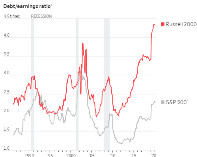
*Net debt divided by earnings before interest, taxes, depreciation and amortization Note: Data excludes financial sector companies.